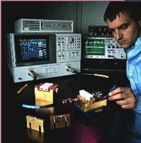
High Frequency Measurement.