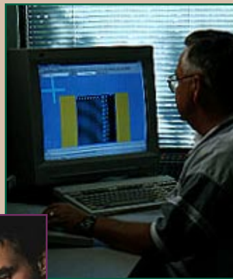
CAD System and Artwork Generation.